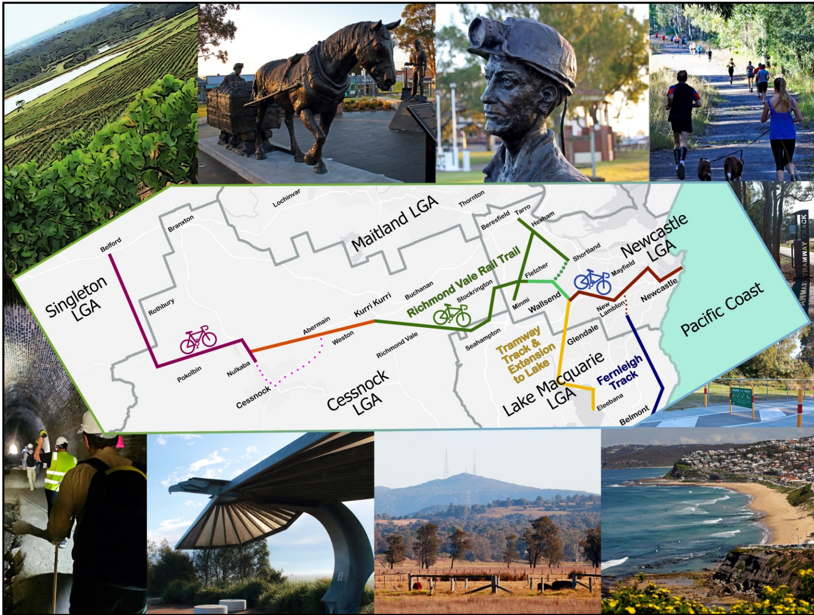
Picture 3. Extract from stylised version of proposed Shiraz to Shore Trail (see Picture 2), with a sample of our previous images.