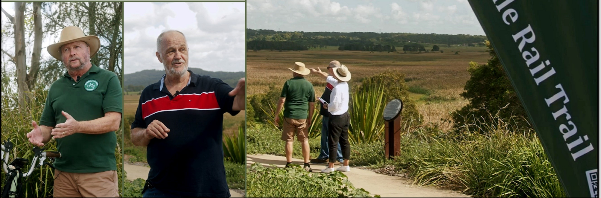
Picture 1. Extracted images from RVRT Supporters' Group contribution to the Pitch Video currently being finalised by Hunter JO.

Some extracted images from the RVRT Supporters' Group contribution to the Pitch Video which is currently being finalised - Kau-Ma Park Fletcher (March 11th 2024).