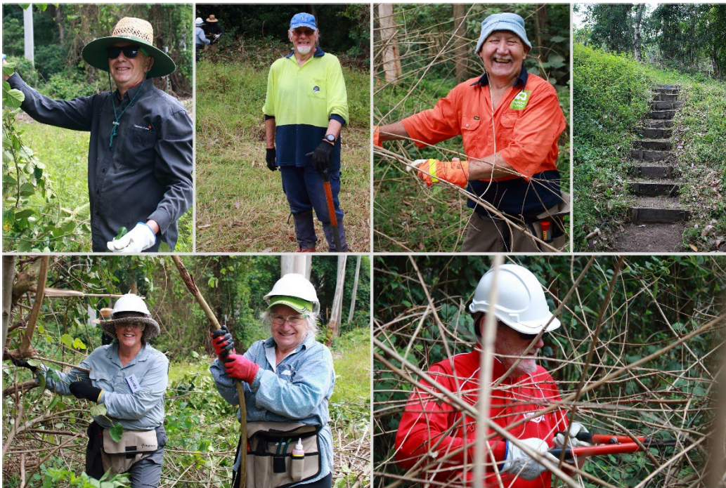
Some photos from the December 2022 and March 2023 Landcare Sessions